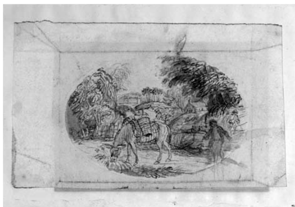
Pencil, ink and wash. Transfer drawing by Thomas Bewick.