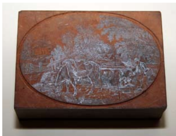
Two angled views of the block without the frame. The lead pencil marks reflect the light to show as white.

Favoured over time with offers of many choice items – amongst which were sets of vignettes on China paper, coloured drawings and pencil sketches – Edward Ford nevertheless declined the wood block. It was bought instead from Jane Bewick by the Pilgrim Street bookseller Robert Robinson, whose accounts for 2 February, 1859, show: Drawn on the Wood framed Fable cut, Ass Eating Thistles £2.2.0 [Workshop records in Tyne & Wear Archives, 1269/84]