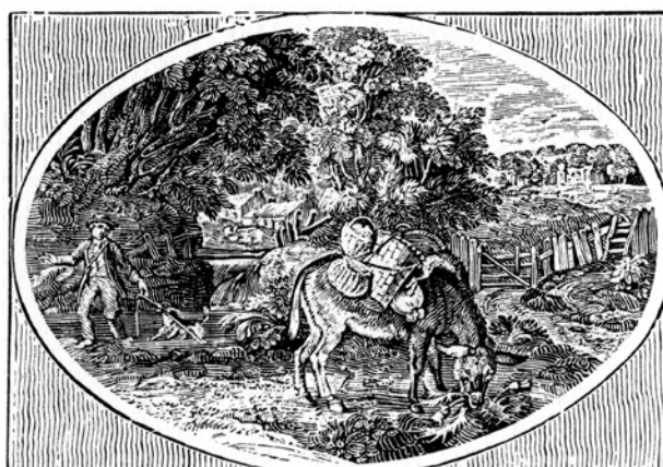
THE ASS EATING THISTLES, from Fables of Aesop , 1818, p.369, printed from the block cut by an apprentice in Bewick's workshop.

The Georgian landscape, often with figures and animals, observed in the tiny vignettes scattered throughout Thomas Bewick's books, has gripped the imagination of successive generations of those interested in his work. The same often appears as a background to his headpiece figures. Let us consider one example: a mill with water-driven wheel in the middle distance; in the foreground, the familiar figure of a heavily laden ass, pausing for a moment, together with a fisherman and dog to one side. The miniature rural scene comes framed by swathes of broad-leaved foliage and a broken fence, a motif so common in Bewick's images as to be almost a signature.